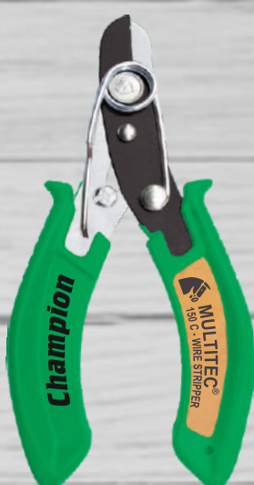
150 C Champion