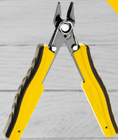
07 A Electra